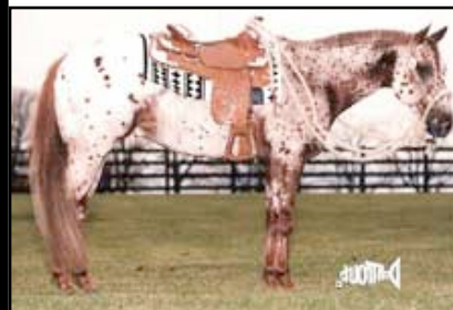
Zippos Scotch Bar